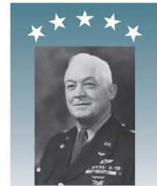
GEN. HENRY H. ARNOLD EDUCATION GRANT PROGRAM

The General Henry H. Arnold Education Grant Program - a centerpiece of AFAS education support initiatives - launches. Since that first year, more than $160 million in grant support has been awarded to date.