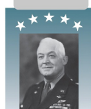
GEN. HENRY H. ARNOLD EDUCATION GRANT PROGRAM

The General Henry H. Arnold Education Grant Program - a centerpiece of AFAS education support initiatives - launches. Since that first year, more than $160 million in grant support has been awarded to date.